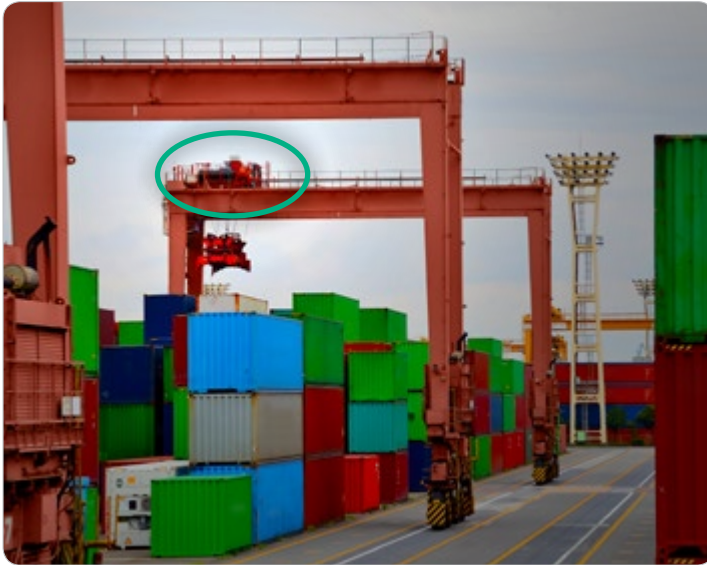
Trolley on the crane tower