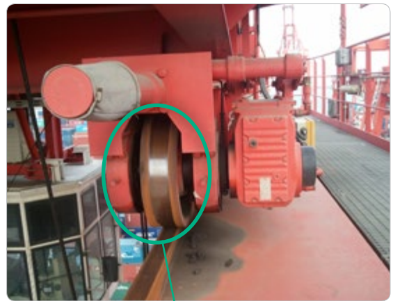
Spherical roller bearing located inside